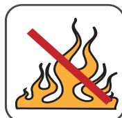
Flame Retardance IEC60332-1-2 /NF C32-070-2.1(C2)