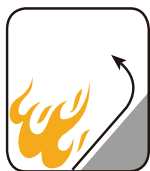
Reduced Fire Propagation NF C32-070-2.2(C1) IEC60332-3-24 EN50266-2-4