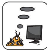
Low Corrosivity IEC60754-2 EN50267-2-2/3 NF C 32-074