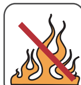
Fire Resistance IEC 60331 /NF C 32070-2.3(CR1)