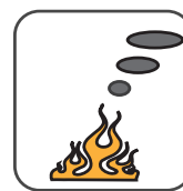
Low Smoke Emission IEC 61034-1&2 EN 50268-1&2/NF C32-073